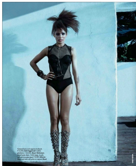
Freida Pinto in Elle India